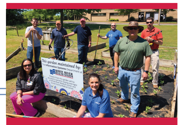
Information Systems' Growing Garden to the Information Systems department for your dedication to