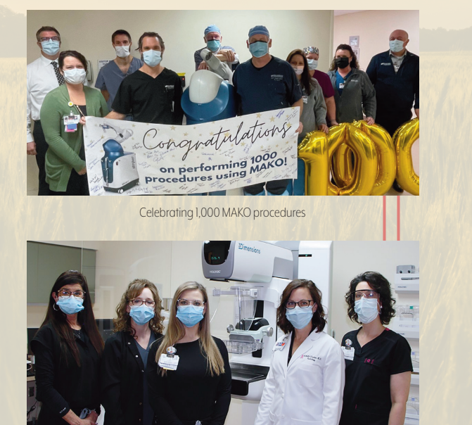
Posing with a new mammography machine

At WRHS, our team made headlines this year for a handful of accomplishments including earning national recognition for winning the American Heart Association's Mission: Lifeline<sup>®</sup> EMS Silver Plus Achievement Award for implementing specific quality improvement measures to treat heart attack patients; performing 1,000 joint replacement surgeries using Stryker's MAKO robotic arm assisted joint replacement system, making WRMC one of only three hospitals in the state to achieve this milestone; as well as raising over $130,000 for the installation of two 3D mammography machines. A big thank you to everyone who made these amazing accomplishments possible.